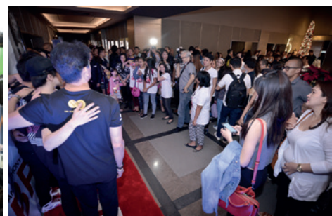
"BREAK" Premiere: Japan - Tokyo